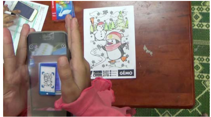
Figure 1. Graphical metaphors on transparent paper.

scanning task within few second and happily interactive with the 3D model.