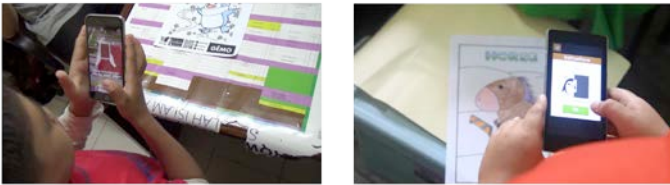
Fig. 2 Left coloured instruction on Quiver, right animated metaphor instruction on wARna.

Metaphor 2 (animated instruction metaphor): The animation instruction metaphor began with an icon of the marker followed by the transition of a phone aiming at the marker and end with at tick mark. There is no sound and it loops until the user press the ok button.